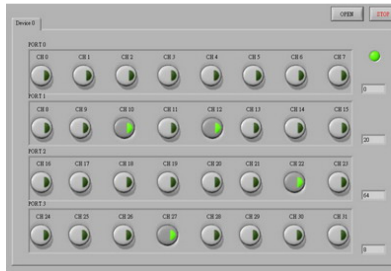
Program Interface by LABVIEW